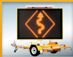
Portable Amber VMS