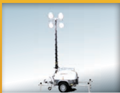
Portable Lighting Towers