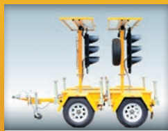
Portable Traffic Signals