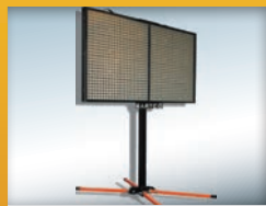
Portable Fold Up VMS