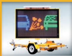
Portable Colour VMS